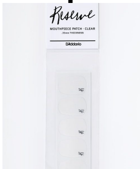
D'Addario Thin (clear) mouthpiece patches