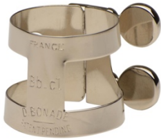
D. Bonade Inverted Ligature