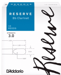
D'Addario Reserve, Strength #3