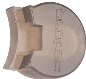
Protech Thumb Rest Gel Cushion