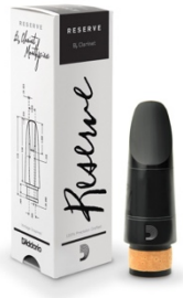
D'Addario X0 (Sometimes X5)